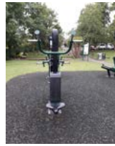
ADULT EXERCISE EQUIPMENT